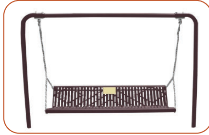
Brown with Gold Plaque