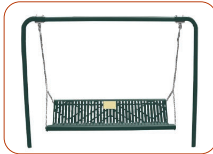
Evergreen with Gold Plaque

All requests for bench memorials go through an approval process. The Centerville-Washington Park District retains the right to approve or deny plaque wording. The Park District reserves the right to deny memorial requests, as well as remove existing memorials in the event the Board of Park Commissioners determine that the bench naming would adversely impact the reputation, image, mission, or integrity of the Centerville-Washington Park District.