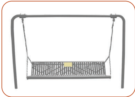
Gray with Gold Plaque