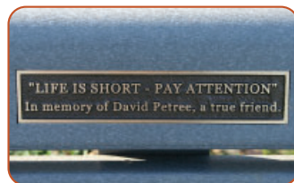
Black with silver lettering and border.