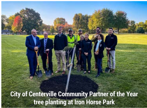
City of Centerville Community Partner of the Year tree planting at Iron Horse Park