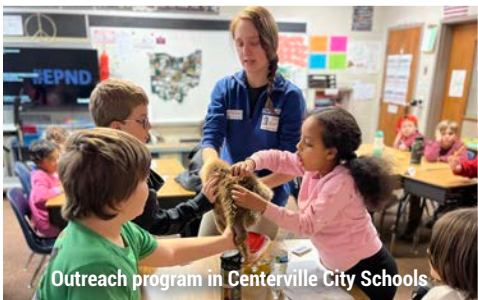
Outreach program in Centerville City Schools