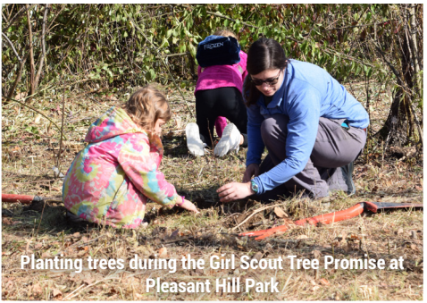
Planting trees during the Girl Scout Tree Promise at Pleasant Hill Park

Volunteers logged 3,614 volunteer hours, a 31% increase from 2022, with an estimated value of $114,925. A BIG thank you to our volunteers for their important contributions!