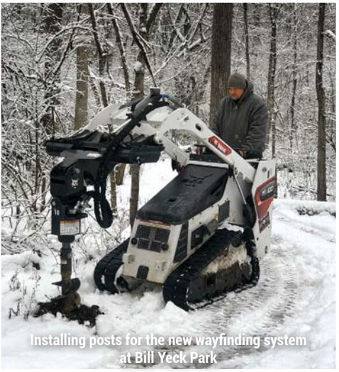
Installing posts for the new wayfinding system at Bill Yeck Park