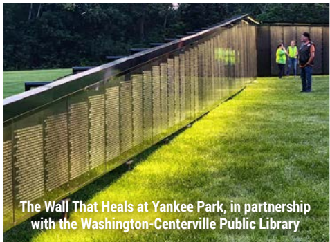
The Wall That Heals at Yankee Park, in partnership with the Washington-Centerville Public Library