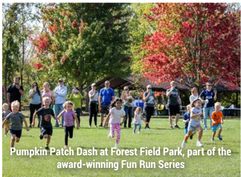
Pumpkin Patch Dash at Forest Field Park, part of the award-winning Fun Run Series

In 2023, residents approved a 10-year levy that provides 30% of the day-to-day operational costs for 51 parks, including upkeep of athletic facilities, trails, shelters, playgrounds, sprayground, dog park and support amenities. We appreciate your continued support of and trust in the Centerville-Washington Park District. We are passionate about creating positive memories for the residents of Centerville and Washington Township! Here's how we did in 2023!