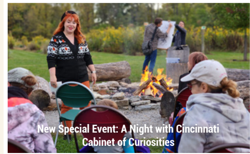
New Special Event: A Night with Cincinnati Cabinet of Curiosities