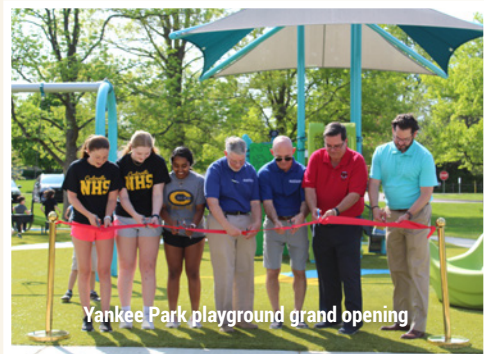
Yankee Park playground grand opening