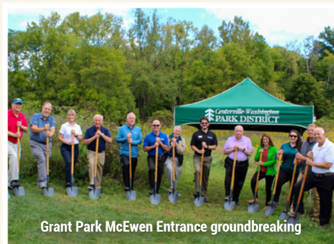
Grant Park McEwen Entrance groundbreaking