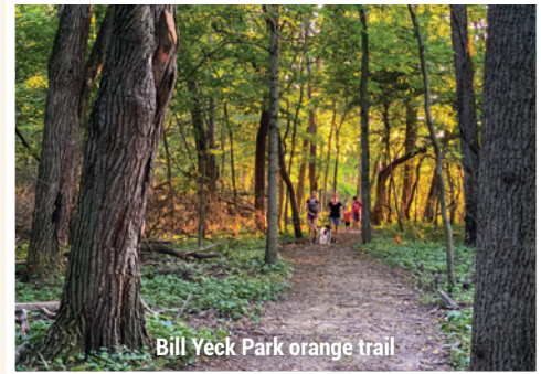
Bill Yeck Park orange trail

Volunteers logged 4,558 volunteer hours, a 50% increase from 2021, with an estimated value of $136,512. A BIG thank you to all of our volunteers for their important contributions to CWPD!