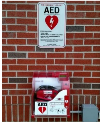
AEDs located near all public restrooms