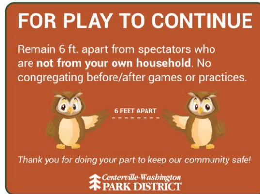
Displayed in and around parks and fields