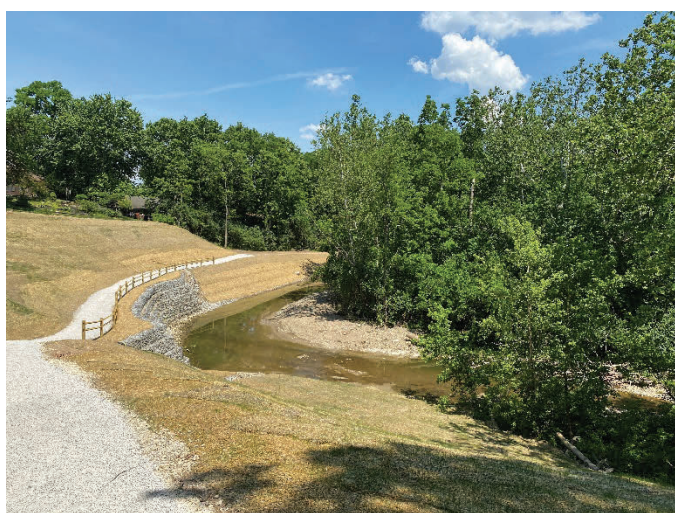
Image: Grant Park's reconstructed yellow trail near the McEwen Rd. entrance of the park.