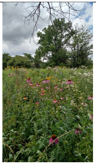
Activity Center Park-July 2015

Bill Yeck Wetland Project : We now have a wetland at Bill Yeck Park. (1, 2)