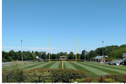
Schoolhouse Park - South Field

Centerville Wee Elks Football- The 2016 Centerville Wee Elks Football season is about to begin. Equipment handouts are scheduled for July 9 followed by the first practice at Schoolhouse Park on Monday, July 25. Registration numbers are down this year resulting in a drop in team numbers from 12 last year to 9 teams this year.