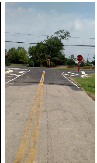
Gebhart Road (looking North to Social Row Road)