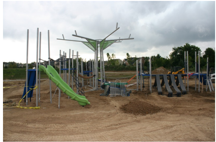
Robert F. Mays Park-Playground installation 2016

Mays Park Playground: As you can see from the photo below, the playground installation is well underway at Mays Park. The project is expected to take approximately 40 days to complete, but at this pace might be complete by the end of the month.