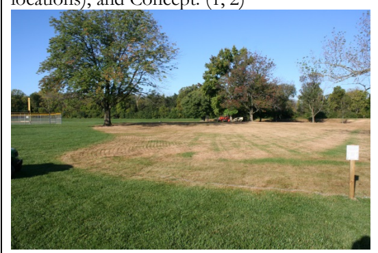
Activity Center Park- Established September 2014

Ohio Pollinator Habitat Initiative- We recently completed the planting of approximately 30 acres of new "native" pollinator habitat at Bill Yeck Park this past month. Additionally, new pollinator habitats were established at the following parks: Yankee, Iron Horse, Little Woods, Stansel, Weatherstone, Grant Park (Normandy T and Grants Trail locations), and Concept. (1, 2)