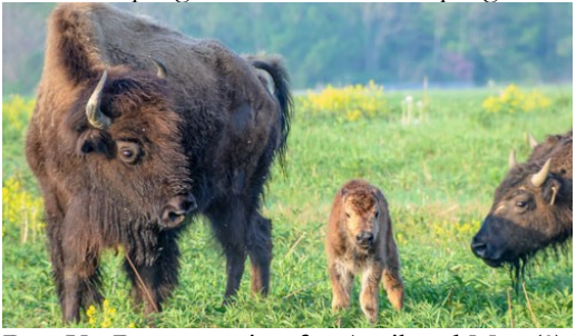
Pop-Up Programming for April and May (3):

volunteer program as well as their program offerings. (5)