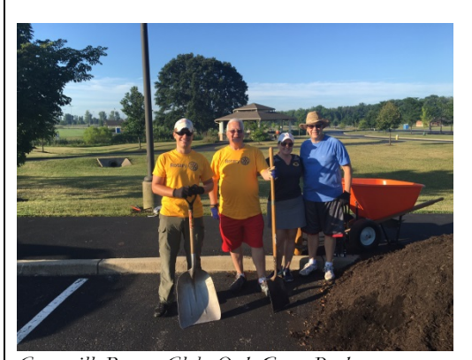
Centerville Rotary Club- Oak Grove Park

I would also like to thank the hard working Centerville Rotarians who also helped contributed to the effort at Oak Grove Park this past month.