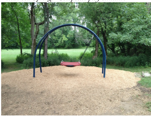
Beechwood Springs- Oodle Swing

KEY : 1. Preserve Habitats & Ecosystems 2. Demonstrate Responsible Land Stewardship 3. Provide Variety of Programs and Activities 4. Develop Park & Facility Amenities for Future 5. Continuously Engage Community 6. Improve Organization Processes.