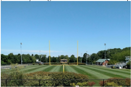
Schoolhouse Park - South Field

only with shortened times to allow all teams to be featured. Regular season games will kick off on Saturday, August 13. All home games will be played at Schoolhouse Park and are anticipated around 60 games total. This is almost a 50 percent drop off from just a few years ago.