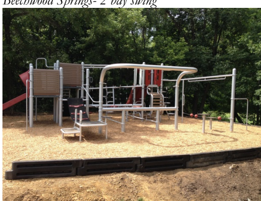
Beechwood Springs- Composite play structure