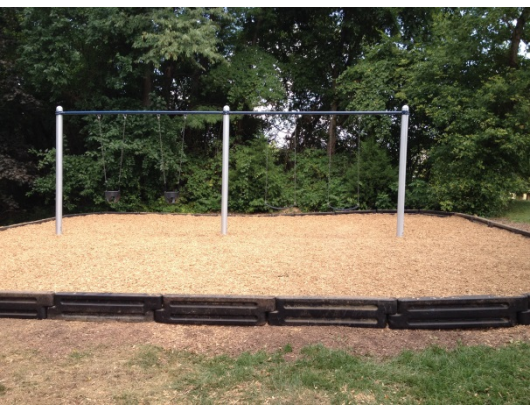
Beechwood Springs- 2 bay swing