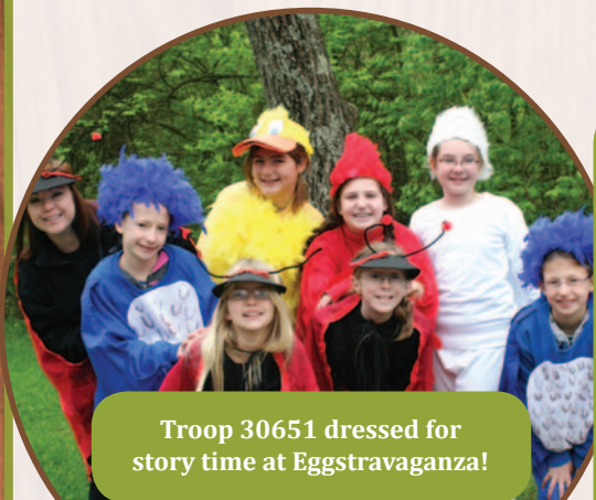
Troop 30651 dressed for story time at Eggstravaganza!