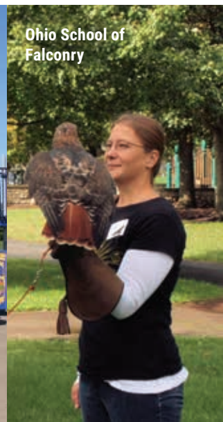
Ohio School of Falconry