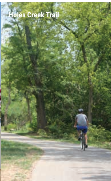
Holes Creek Trail