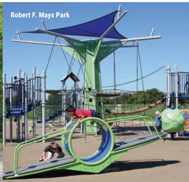
Robert F. Mays Park