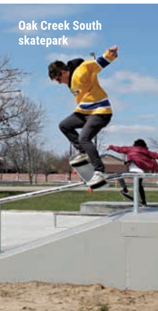
Oak Creek South skatepark

Provide quality parks, outdoor education and recreation while preserving open space.