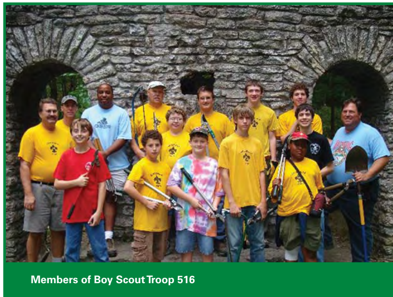
Members of Boy Scout Troop 516

We recognize the need for quality fitness and wellness programs in our community to encourage healthy lifestyles. Therefore, beginning next spring, we will offer a NEW program called Pathways: A Community Walking Tour. This program will identify 21 different pathways throughout our community. Each pathway will begin and end or pass through one of the Centerville-Washington Park District's 47 parks. Look for more information on this FREE program in our spring newsletter