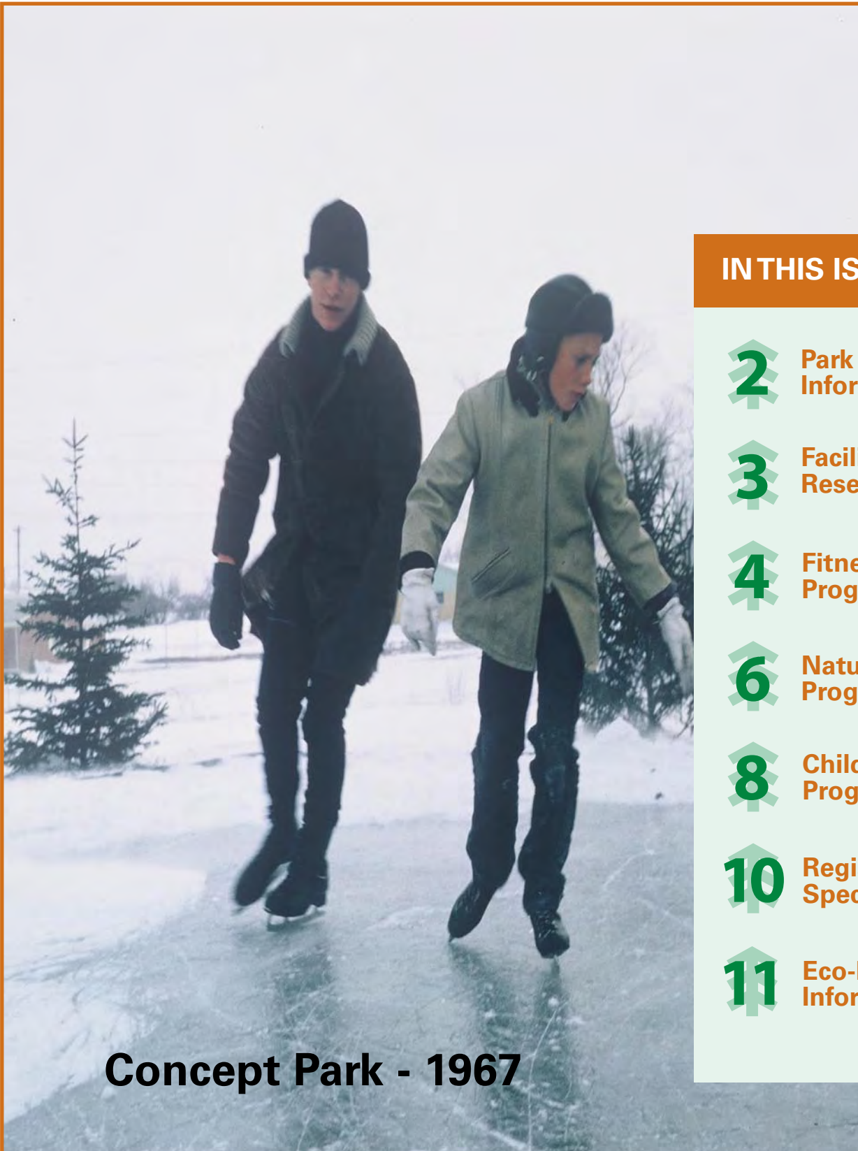
Concept Park - 1967